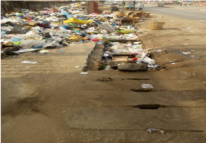
Plate 5. Drains and the surrounding are covered with solid wastes (Fieldwork, 2018)