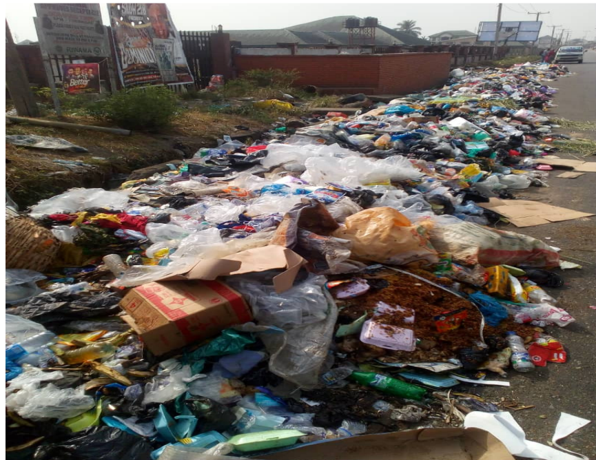
Plate 2. Roads littered with solid wastes on Ikwerre Road, Port Harcourt (Fieldwork, 2018)