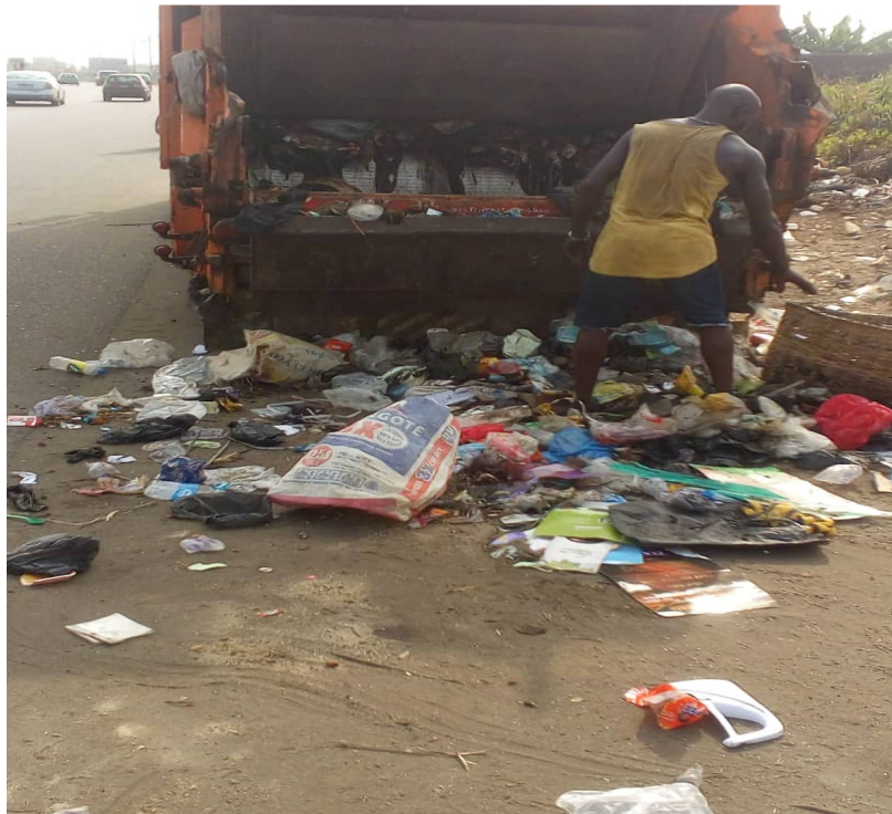
Plate 3. A scavenger scattering waste in search for a precious item (Fieldwork, 2018)