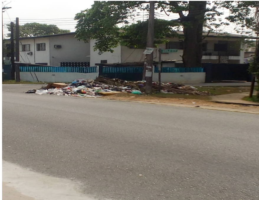
Plate 1. A typical residence on Ameachi Drive GRA, Port Harcourt (Fieldwork, 2018)