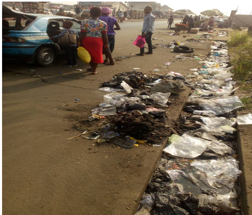
Plate 4. Commercial activities going on normally in a dirty environment (Fieldwork, 2018)