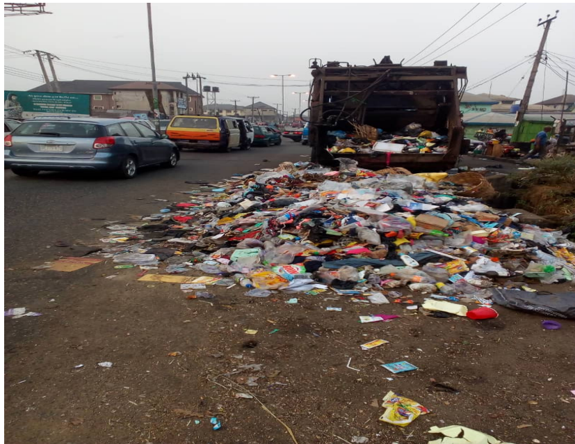
Plate 6. A broken down truck over a solid waste dump (Fieldwork, 2018)

© 2019 Bodo; This is an Open Access article distributed under the terms of the Creative Commons Attribution License ( http://creativecommons.org/licenses/by/4.0 ), which permits unrestricted use, distribution, and reproduction in any medium, provided the original work is properly cited.