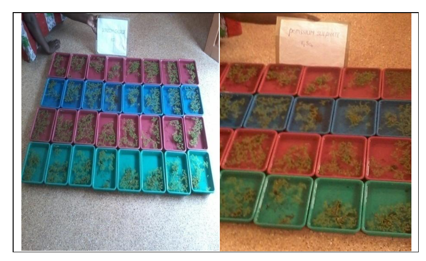
Plate 1. View of incubation experiment

H<sub>2</sub>SO<sub>4</sub> provided nascent oxygen which combined with carbon to form CO<sub>2</sub>. The excess chromic acid left unused by the organic matter was determined by back titration with 0.5 N ferrous sulphate or ferrous ammonium sulphate using diphenylamine indicator [8]. Available nitrogen in the soil was estimated by alkaline permanganate method [9]. Available phosphorus extracted with 0.03 N NH<sub>4</sub>F and 0.025 N HCl. The amount of P extracted was treated with ammonium molybdate and antimony potassium tartarate and developed colour with ascorbic acid. The intensity of blue colour /was determined colorimetrically at 660nm [10]. The soil was leached with neutral normal ammonium acetate and the K^+ ions in the exchange sites were replaced by NH_4^+ ions. The K<sup>+</sup> ions in solution was then determined with the flame photometer [11].