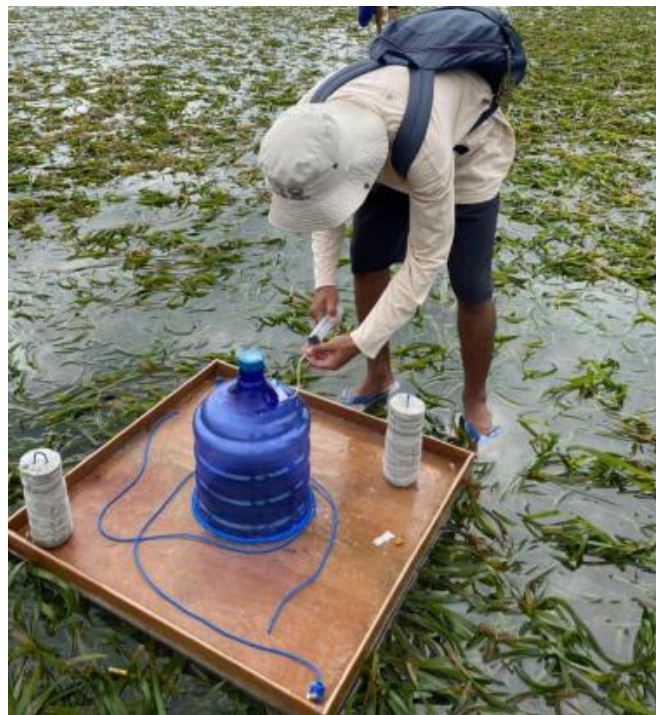
Fig. 3. Gas sampling via syringe in the Rh-chamber in the seagrass sedimentary area