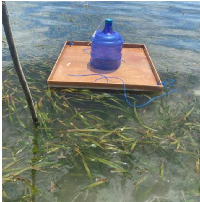
Fig. 4. Operational placement of Rh-chamber for gas sampling on the surface of seagrass waters