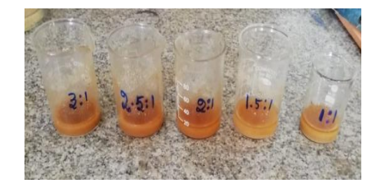
Fig. 3. Solubility testing of dried tamarind pellets

Solubility of dried tamarind pellets: It is defined as the maximum quantity of a drug dissolved in a given volume of a solvent at a certain temperature. Solubility information is very important when designing food based pellets. The partial solubility and complete solubility of the dry tamarind pellets were analyzed in the following method given by Takeru et al. [15] with some modifications. The tamarind pellet 1 g (1 pellet) was added into the 100 ml of distilled water and immersed in water bath. The dissolution process was carried out in water bath at three differential temperatures such as 55 °C. 65 °C and 100 °C with and without stirring of the solution with a glass rod. The solubility tested samples were illustrated in the Fig. 3. The time duration taken for the complete and partial solubility of the dried tamarind pellets at each and every temperature conditions was noted.