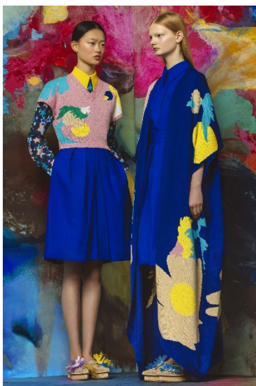
Figure 3. Delpozoz Resort 2017 Fashion Show

In Lessing's book Laocoon (2009), he presents that plastic artists usually avoid to depict the moment of reaching a passion vertex, because that means it comes to an end. This may also explains the fact that intriguing art works (e.g. Venus de Milo) express vague integrity in individual's mind through visually fracture and psychologically gratification pursuing, it is just "the Most Beautiful" in each person's own expectations.