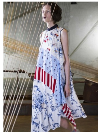
Figure 7. Antonio Marras Resort 2017 Fashion Show