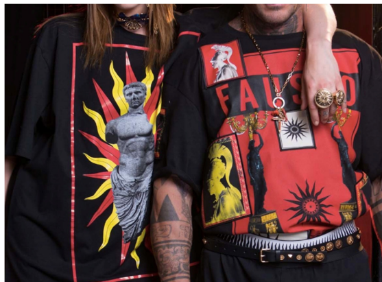
Figure 5. Fausto Puglisi Spring 2017 Menswear Fashion Show Details

Faith Connexion's Resort 2017 lineup (2016) presents a street-style art show with some political atmosphere. Both the design of painting slogan on a Union Jack top and the Chanel type tweed coat have become a weapon to express strong value and faith. Because of the same season, Fausto Puglisi (2016) releases his spring collection with dazzling decorations — flowers and the sun, knights and shields, marbles and the cross — massive classic elements are exhaustively covered on the fabrics with typical Italian style which correspond with each other as if a high renaissance period is reproduced (Figure 5). It is different from Italianate Dolce & Gabbana's lithesome and graceful pattern, Fausto Puglisi's design is both classical and advanced, both proud and rebellious. On the other hand, it can be seen that marble portrait is also used in Trussardi's (2016) menswear collection. The designer applies bright colour bars to blind the unseeing eyes of the statues, and especially in the showroom that is more moonstruck creating a conflict of madness and civilisation.