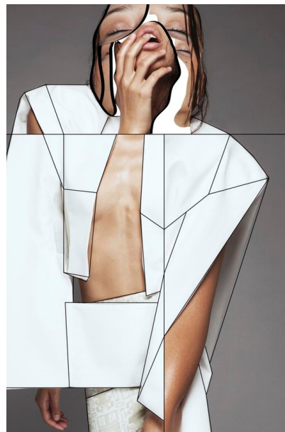
Figure 2 Fashion E-Collage by Peianov, B.

Collage means to paste on a surface by combining diversified materials or substances, for instance, the online Oxford Dictionary (2016) defines collage as "a piece of art made by sticking various different materials such as photographs and pieces of paper or fabric on to a backing." Nowadays, the rapid-developing computer science provides greater spaces and more techniques to do art. To be more concretely, quite a lot of image manipulation softwares are like a collage board, e.g. Adobe Company released Photoshop 3.0 in 1994 with an important addition that its layers allowed operators to process each individual image in different layers, which was a digitised collage, namely an E-collage. The processing methods of this kind of collage not only can patch and paste, but also it can digitalise colour and blend them by using particular formulas, moreover, E-collage allows transparency expression,