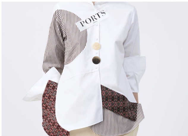
Figure 6. Ports 1961 Resort 2017 Fashion Show Details