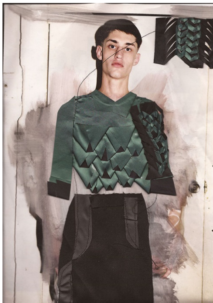
Figure 1. Fashion Collage by Alejos, E.

Traditional Collage could be one single work by modern artists, or "bricoleurs", and also a sketchbook that is commonly created by designers who combine their thought fragments into new vivid pictures. Eugenia Alejos (2012) is clever at this kind of collaging, Figure 1 is the one of her collage collection "You don't need a computer to make a poster". The work is based on a fashion photograph with rebuild fabrics and rough sewing threads which are fantastic forms to aggregate her "objets trouvés"—they could be every available thinking, object or space.