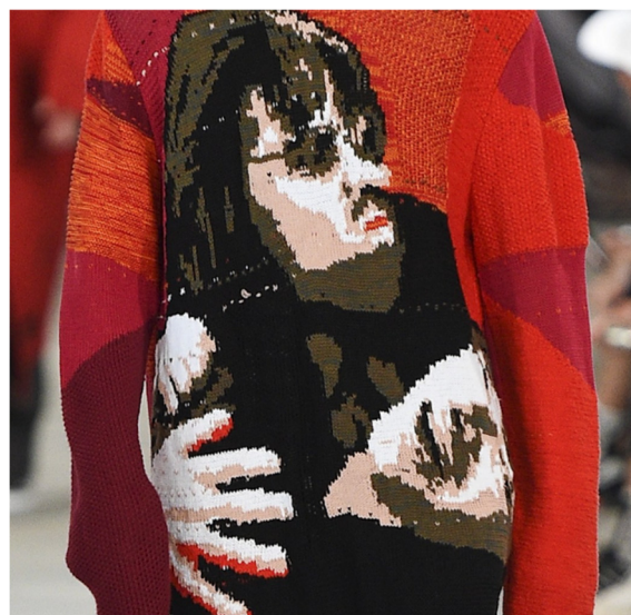
Figure 4. Off-White Spring 2017 Menswear Fashion Show Details