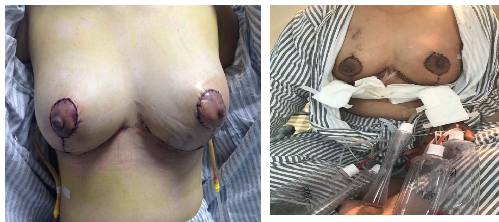
Figure 3. The postoperative renderings.