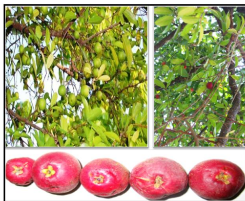
Fig. 1. Garcinia indica tree from Konkan area near Mulshi Pune district Maharashtra, India

provide relief from sunstroke; tackle dysentery and mucus diarrhea; improve appetite and quench thirst; treat bleeding piles, tumors and heart problems; and as a tonic for the heart and liver. Due to its known traditional use the fruit has widely been studied for treating various diseases. The two major phyto constituent isolated from the fruit of the tree are Hydrocitric acid known to be an anti-obesity agent and garcinol an anti-oxidant [3].