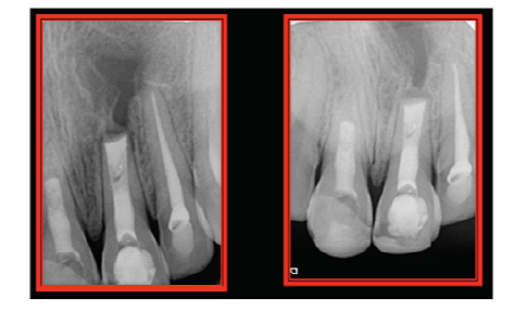
8 Months follow-up 12 Months follow-up

Pre-treatment Apical seal with MTA Root canal obturation