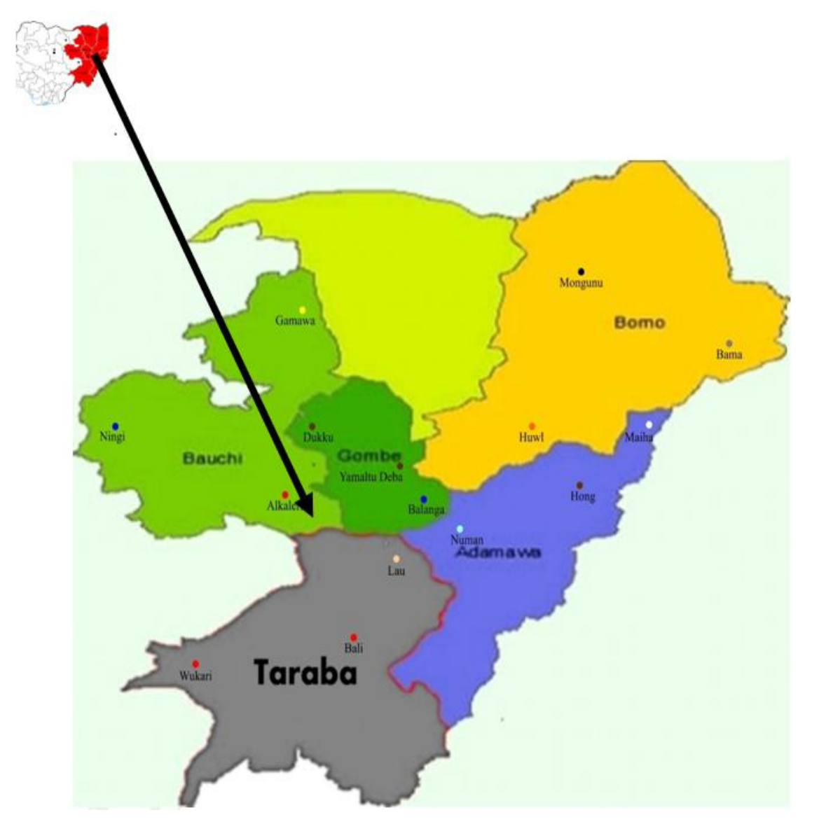
Fig. 1. Map of study area showing the local government area visited

of the few priority plants were tested against mosquito species. Table 1, showed the profile of test plants used traditionally as mosquito's repellent in north eastern Nigeria.