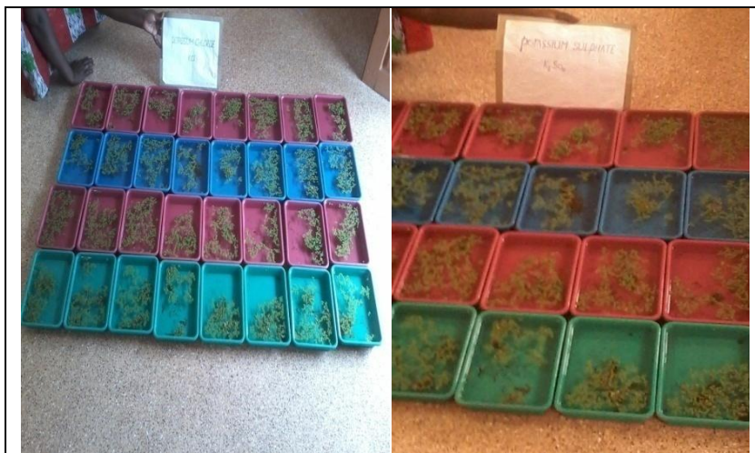
Plate 1. View of incubation experiment

H_2SO_4 provided nascent oxygen which combined with carbon to form CO_2 . The excess chromic acid left unused by the organic matter was determined by back titration with 0.5 N ferrous sulphate or ferrous ammonium sulphate using diphenylamine indicator [8]. Available nitrogen in the soil was estimated by alkaline permanganate method [9]. Available phosphorus extracted with 0.03 N NH_4F and 0.025 N HCl. The amount of P extracted was treated with ammonium molybdate and antimony potassium tartarate and developed colour with ascorbic acid. The intensity of blue colour /was determined colorimetrically at 660nm [10]. The soil was leached with neutral normal ammonium acetate and the K^+ ions in the exchange sites were replaced by NH_4^+ ions. The K^+ ions in solution was then determined with the flame photometer [11].