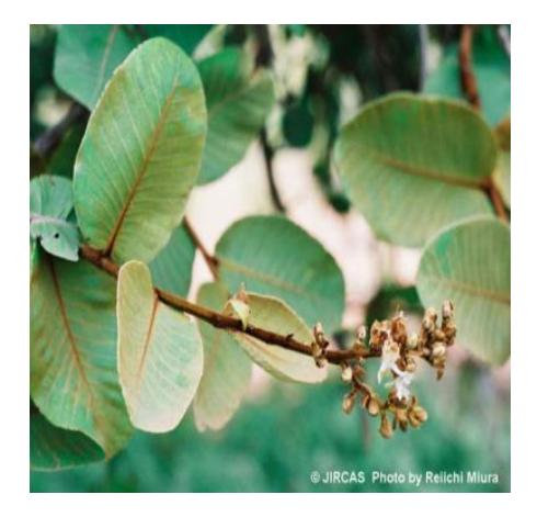
Fig. 3. N. macrophylla Leaves

"In terms of mineral elements, the paste and flour of gingerbread plum were shown to predominantly contain calcium, phosphorus, magnesium, sodium, potassium, iron, copper, zinc and manganese, which varied between locations" [23]. "Gingerbread plum seed had a good solubility profile between pH 4 and pH 10, with an amino acid score of 65.53% and a protein efficiency ratio of 2.35%. It measured 145 mL/100 mL and 110 mL/100 mL for forming capacity and stability, and 3.01 and 3.12 g/g for water holding capacity" [24]. "Its bulk density was 0.30 g/mL and its emulsifying capacity was 29% [24]. It has been demonstrated that, in addition to proteins, lipids, vitamin C, and other mineral ingredients, the pulp of N. macrophylla contains about 60% water" [25]. The bioactive constituents of the plant which contribute to its pharmacological or therapeutic actions are mainly steroids, flavonoids and glycosides (Fig. 4). Other active compounds have been identified, such as chlorogenic acid, hyperoside, procyanidin B2 and other procyanidins [6].