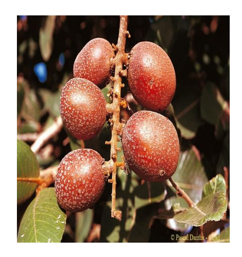
Fig. 2. N. macrophylla fruit