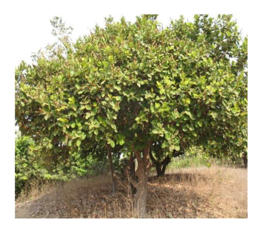
Fig. 1. N. macrophylla tree