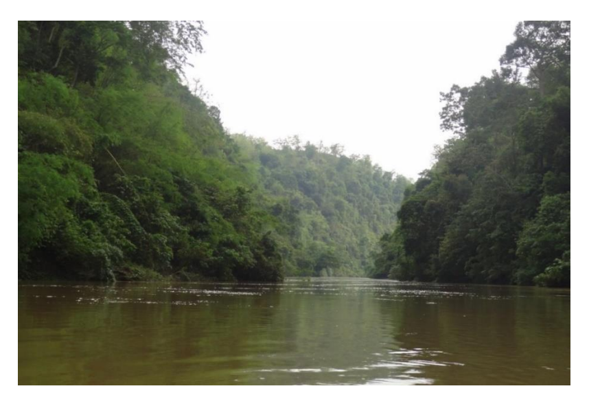
Fig. 4. Sampling site (Amphicherra) of Clupisoma naziri (Anwar and Mirza)