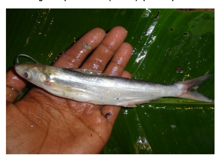
Fig. 2. Clupisoma naziri (220 mm) specimen