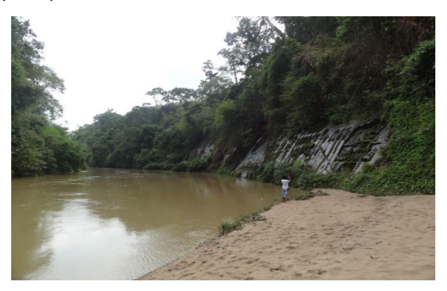
Fig. 3. Sampling sites (Chabimura) of Clupisoma naziri (Anwar and Mirza)

specimens was taken usina Mitutovo Vernier Caliper before permanent preservation. Different water quality parameters of the habitat viz., Temperature, pH, DO, and alkalinity were measured by following the standard method APHA [13]. Identification was mainly done based on various morphometric and meristic characters on both fresh and preserved specimens. In fresh specimens, color had been taken for consideration during identification, where as it was not possible for preserved specimens. sampled fish specimens were identified with the help of standard literature viz, Talwar and Jhingran [14], Viswanath [2], Barman [15], Jayaram [3].