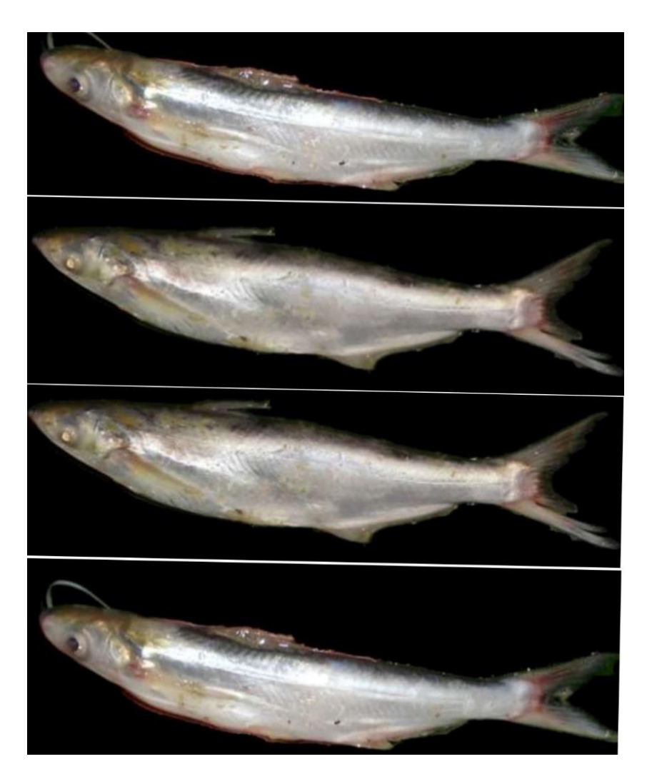
Fig. 1. Clupisoma naziri (300 mm) specimen plate