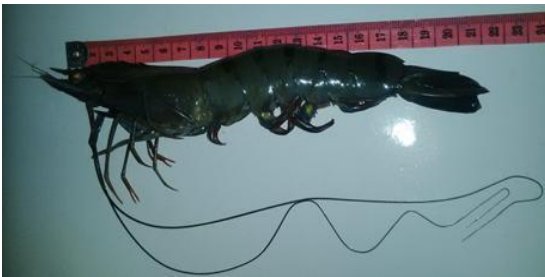
Plate 1.1. Showing the prawn during measurement in the laboratory

The study documents great variability in parasite load and diversity in P. monodon . This observation spells danger to the high population of consumers that cherish sea foods especially, the shrimps. It is envisaged that the consumption of the shrimps from the study area may present a veritable avenue for zoonoses in the populace thereby further deteriorating the fragile public health status of the people of the area and Nigeria at large. The study attributes the heavy parasite load and diversity in the examined shrimps to the suitability of the shrimps to parasitism occasioned by the nutritional affiliation of the animals and the poor physicochemical characteristics especially dissolved oxygen, temperature and conductivity of the water body. The study buttresses the result of the work by Jayati and Probir [20] who report heavy site specific parasitism in shrimps.