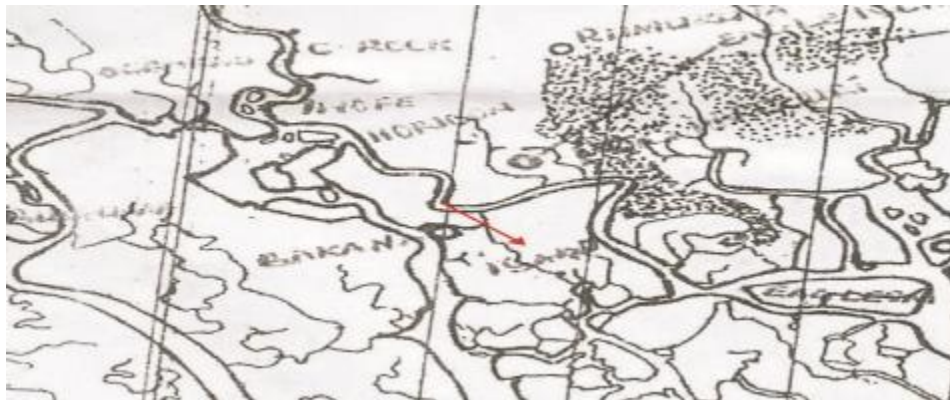
Fig. 1. Arrow showing the study area (Isaka)

Length related parasitism in P. monodon revealed parasite accumulation as length increased. In this study, although prawn length (cm) did not entirely signify age, however, age was rationally associated with prawn length if growth (permanent increase in length and weight) must be associated to time as was the case in this study. Data showed that the larger prawns ( \pm 14 -15.66 cm) harbored more parasites than the smaller prawns ( \pm 6 -13.99 cm). Observations showed that the length class; 14-15.99 cm harbored more parasites at all sites of